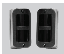
Wired Safety Beams