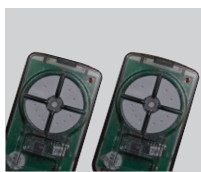
Two TrioCode™ 128 transmitters