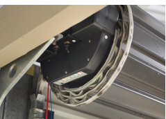
Weather Resistant Opener